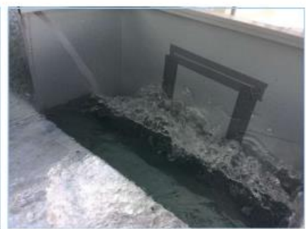
DB 600-1, Q = 16 l/s (box gutter slope - 1 in 200)