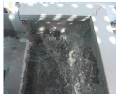
DB 200-1, Q = 16 l/s (box gutter slope - 1 in 200)